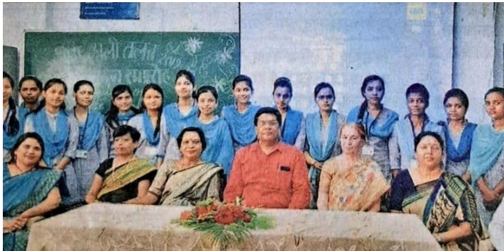
Department of Zoology and Biotechnology

Students learn about more intensive fish farming in composite fish culture systems.